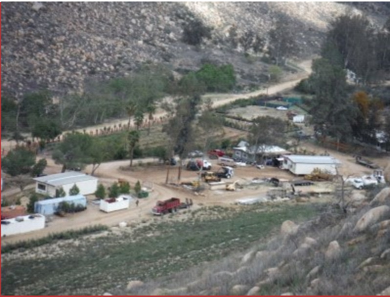
Overview of Rancho Cardena's