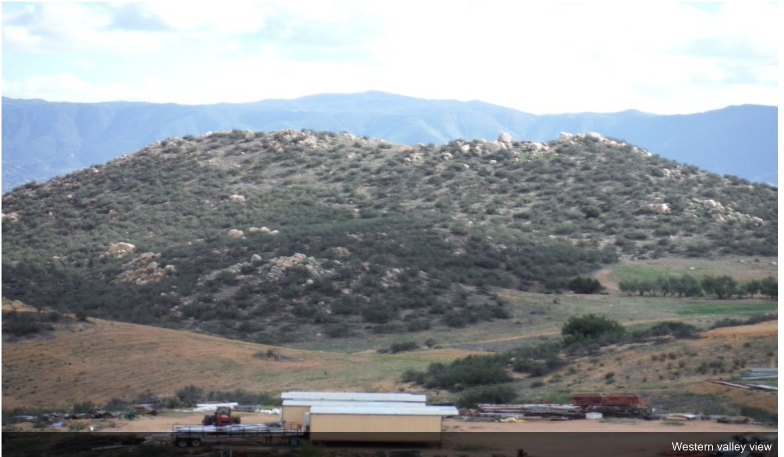
Western valley view