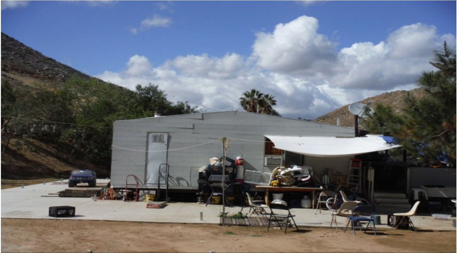
Mobile Home with concrete slab for future patio