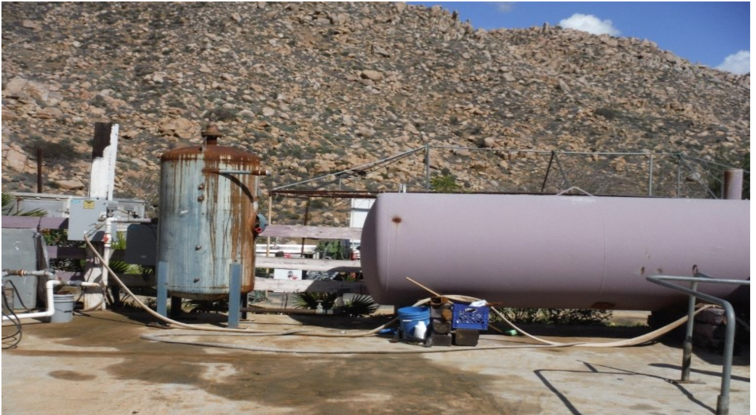
Well 1 65 GPM