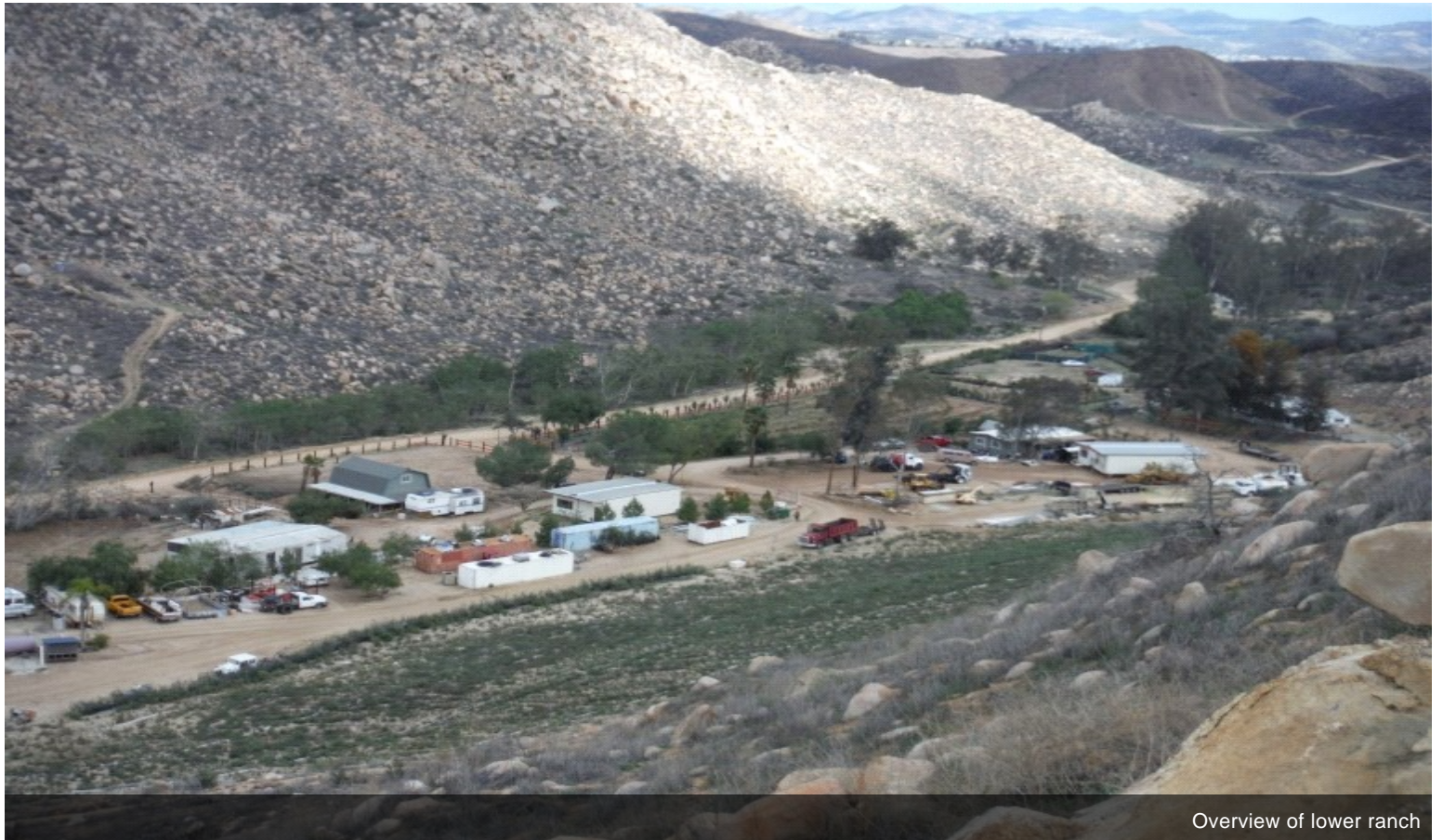
Overview of lower ranch