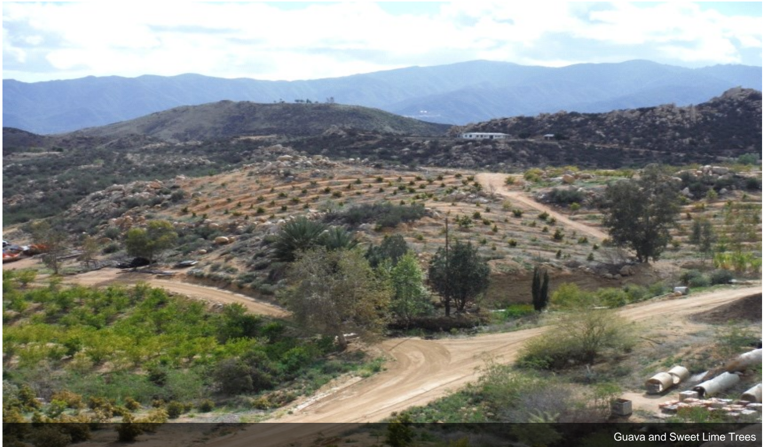
Guava and Sweet Lime Trees