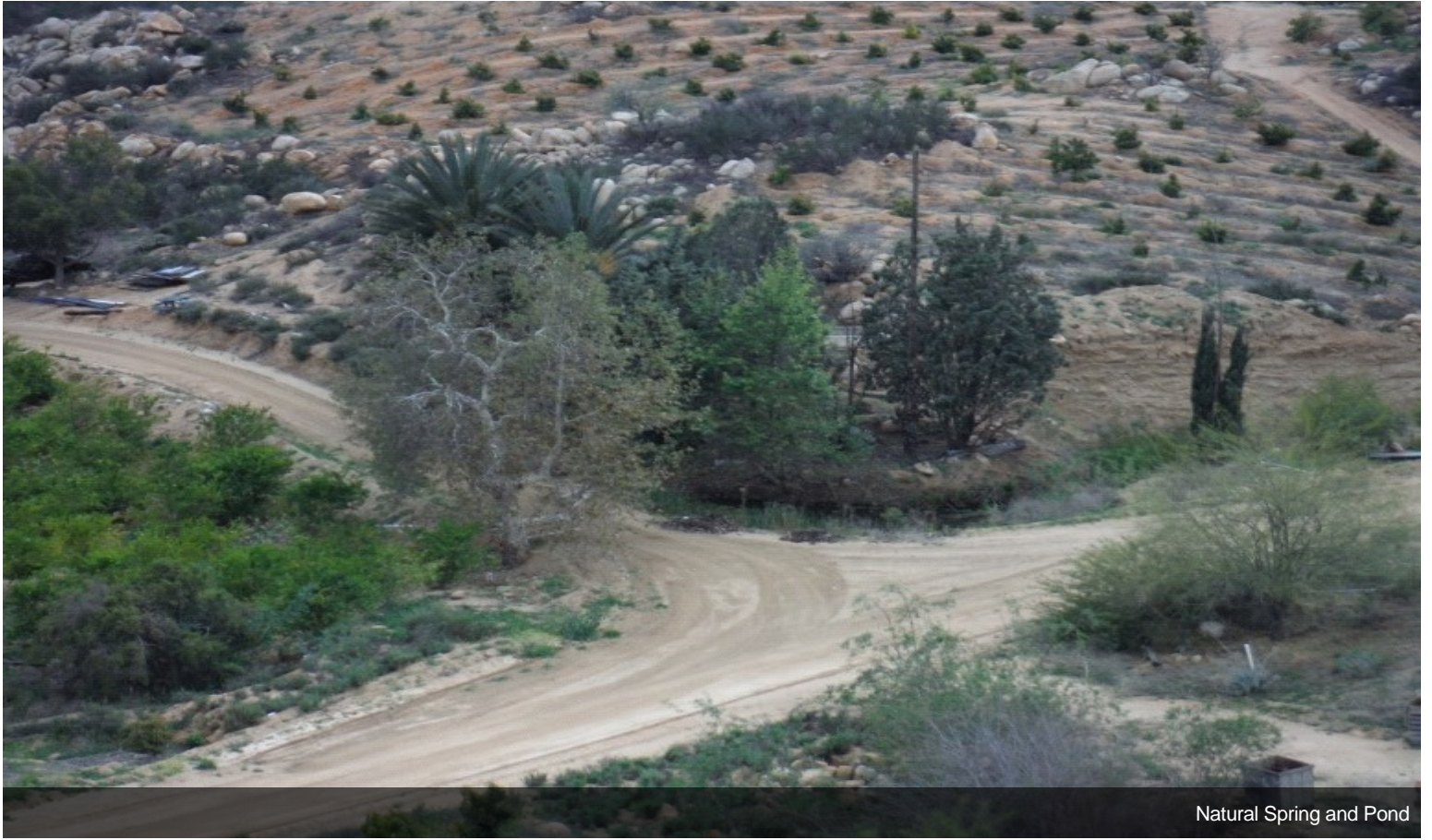
Natural Spring and Pond