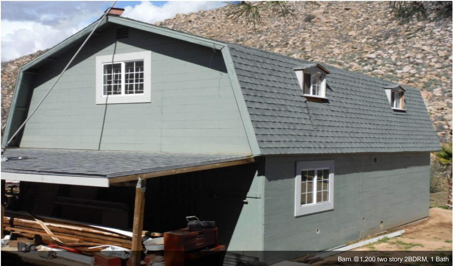
Barn @ 1,200 two story 2BDRM, 1 Bath