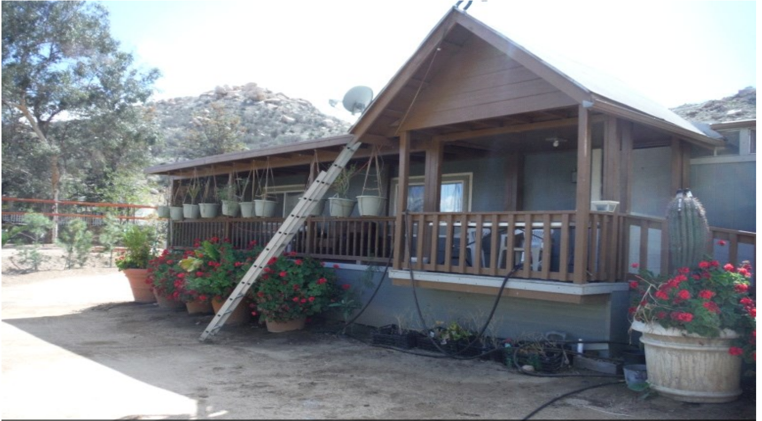
Main house 3 BDRM/ 2 Bath w/ Central Heating and Cooling