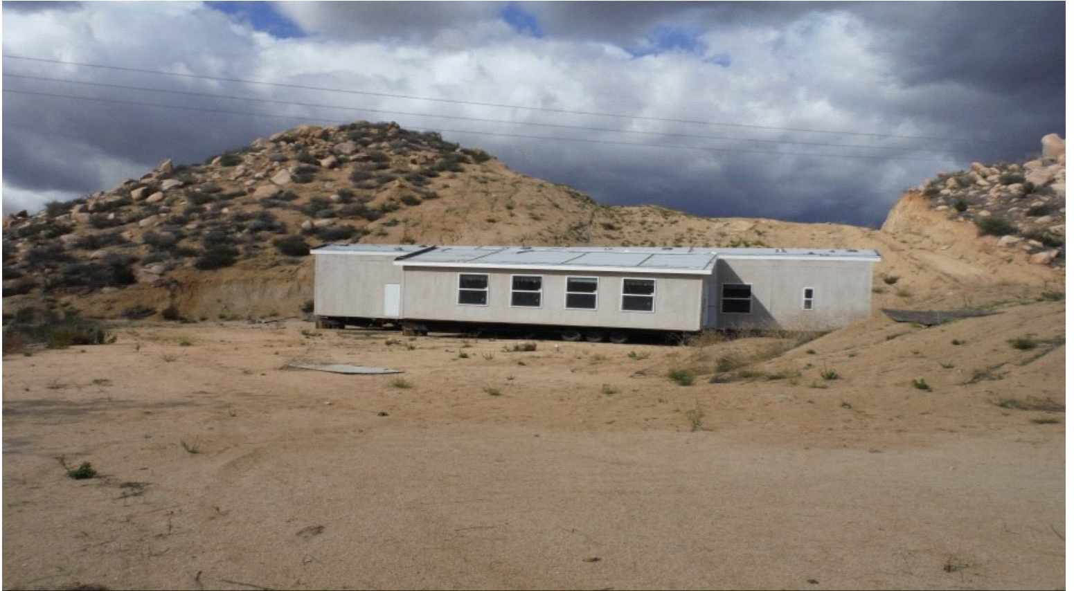
Triple Wide Mobil Home